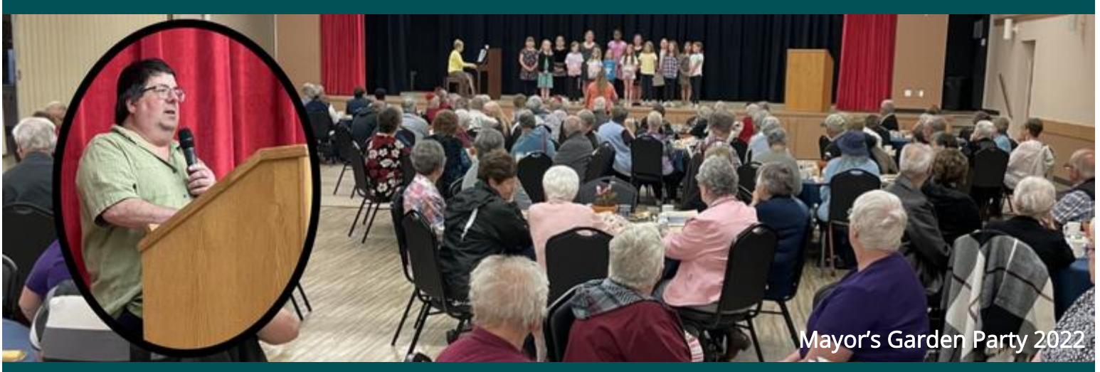
Mayor's Garden Party 2022